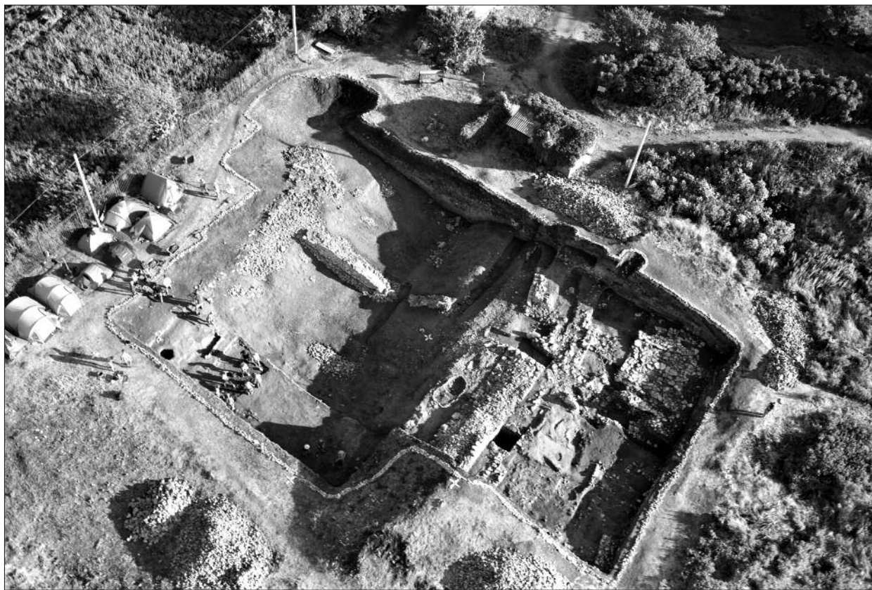
Fig. 1. Sector XXV (Kite photo M. Bogacki).

Ryc. 1. Wykop XXV, fotografia latawcowa.