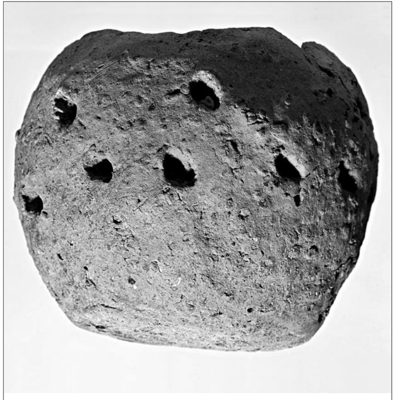
Fig. 3. Clay censer. Ryc. 3. Gliniana kadzielnica.