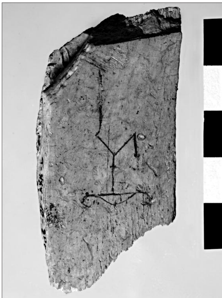
Fig. 2. Sarmatian tamga

Ryc. 1. Wykop XXV, fotografia latawcowa.