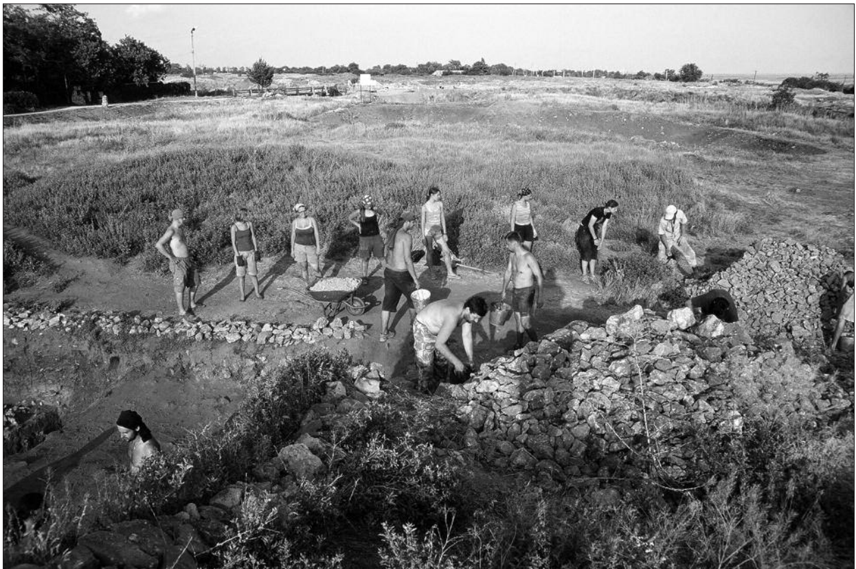
Fig. 4. Sector XXV, conservation. Ryc. 4. Wykop XXV, konserwacja.