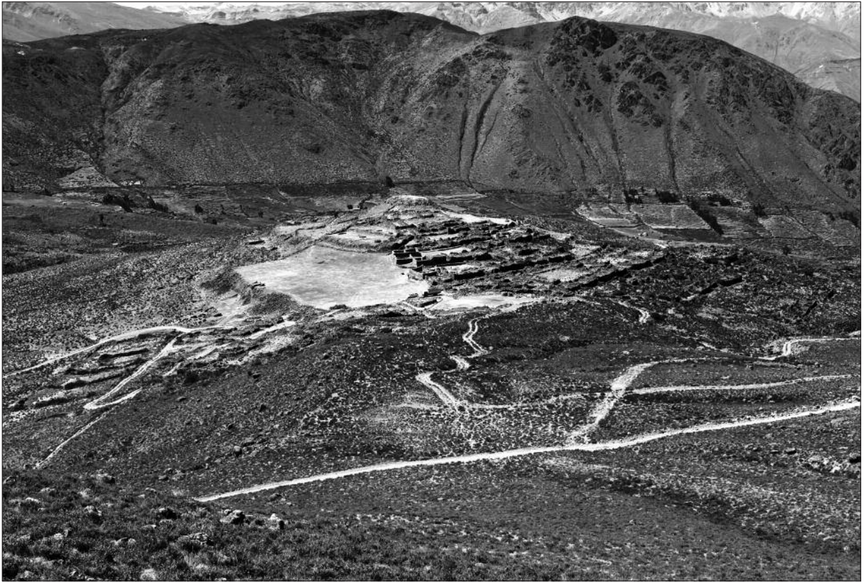
Fig. 2. View of Maucallacta, showing the pyramidal structure and the main ceremonial platform.

Ryc. 2. Widok na stanowisko Maucallacta; widoczna piramida i główny plac ceremonialny.