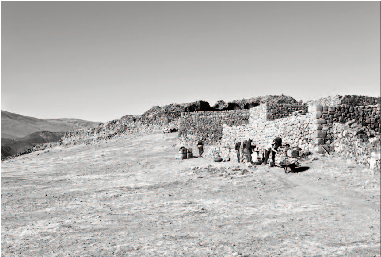
Fig. 6. North wall of Building A, Square 3. Work consolidating the structure of the face of the wall, within the banquette (Photo M. Sobczyk).

Ryc. 6. Północna ściana budynku A, plac 3. Prace konsolidujące strukturę lica muru, w obrębie bankiety.