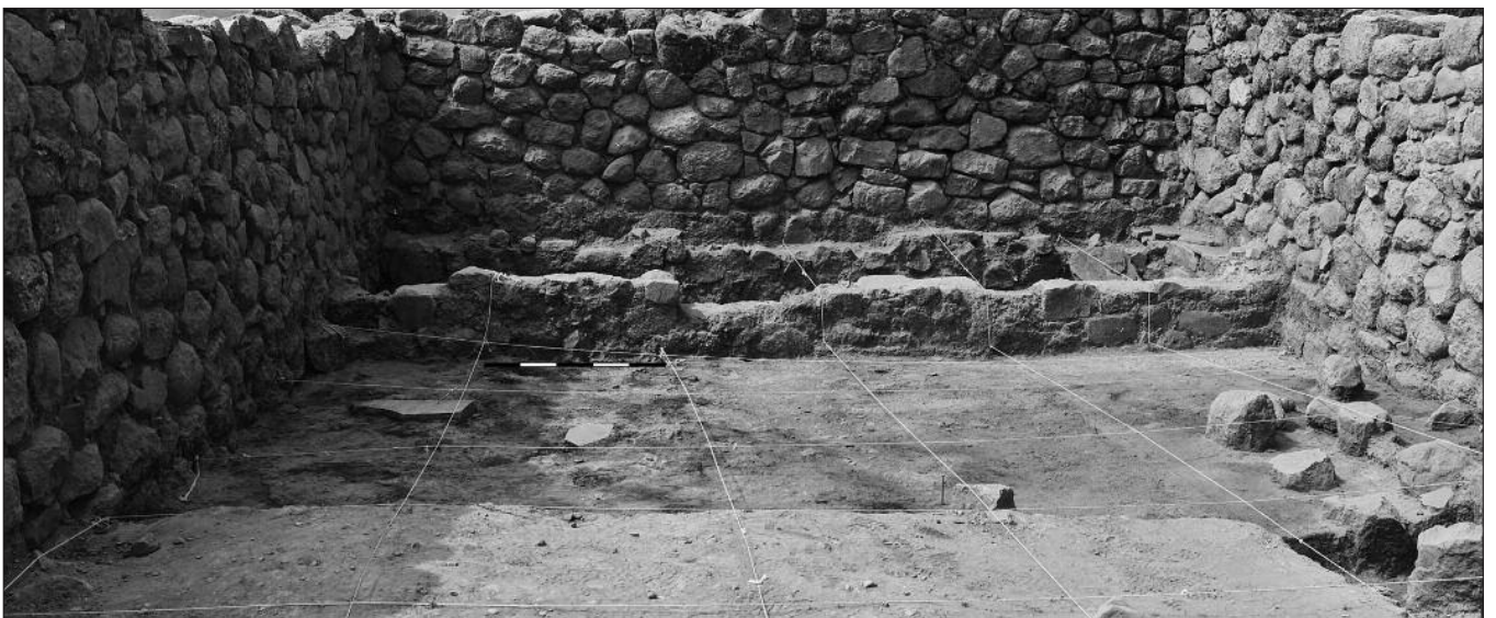
Fig. 3. Square 3, Building A, the inside of the discovered “storage”.

Scattered across the whole area were loose ceramic fragments. A very interesting discovery was made at the foot of the southern wall, near the entrance to the building, where stone pillars were found imbedded in the floor, in two rows