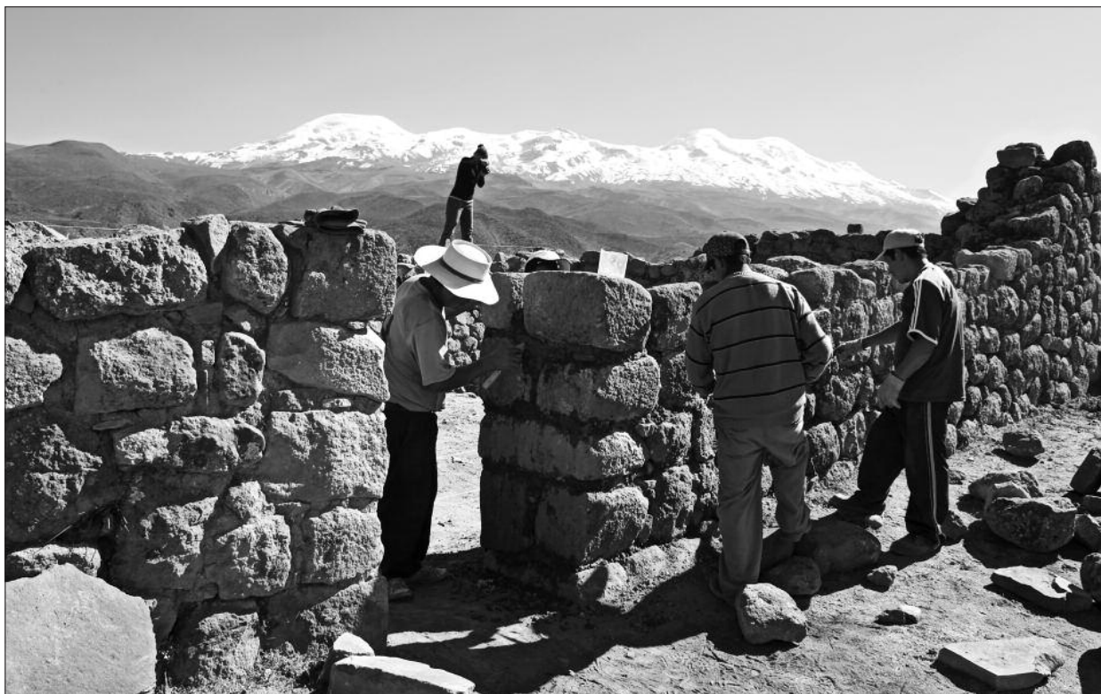
Fig. 5. Reconstructed front wall of Building A, Square 3. Ryc. 5. Rekonstrukcja frontowej ściany budynku A przy placu 3.