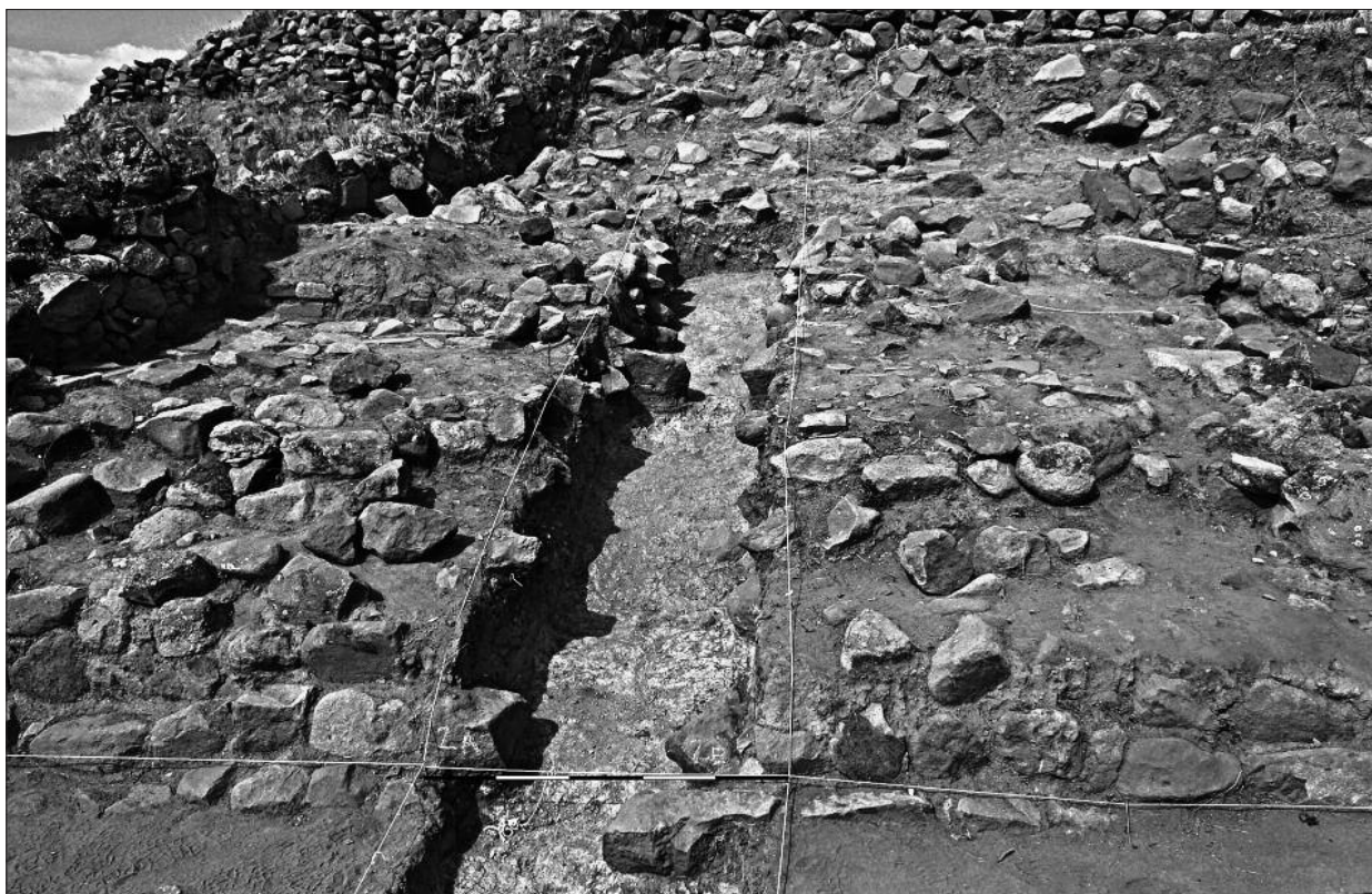
Fig. 4. Pyramid, a group of small platforms (stairs), for the entrance to the top of the pyramid (Photo M. Sobczyk). Ryc. 4. Piramida, niewielkie platformy (schody), służące jako wejście na szczyt piramidy.