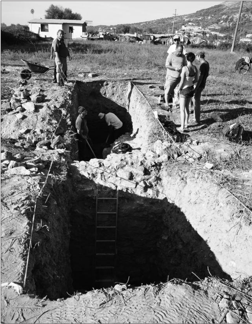
Fig. 4. Trial trench on the town wall.