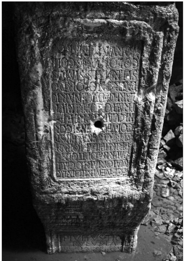
Fig. 3. Inscription in the cistern pillar (Photo M. Lemke).

Ryc. 2. Mury iliryjskie nadbudowane w czasach weneckich.