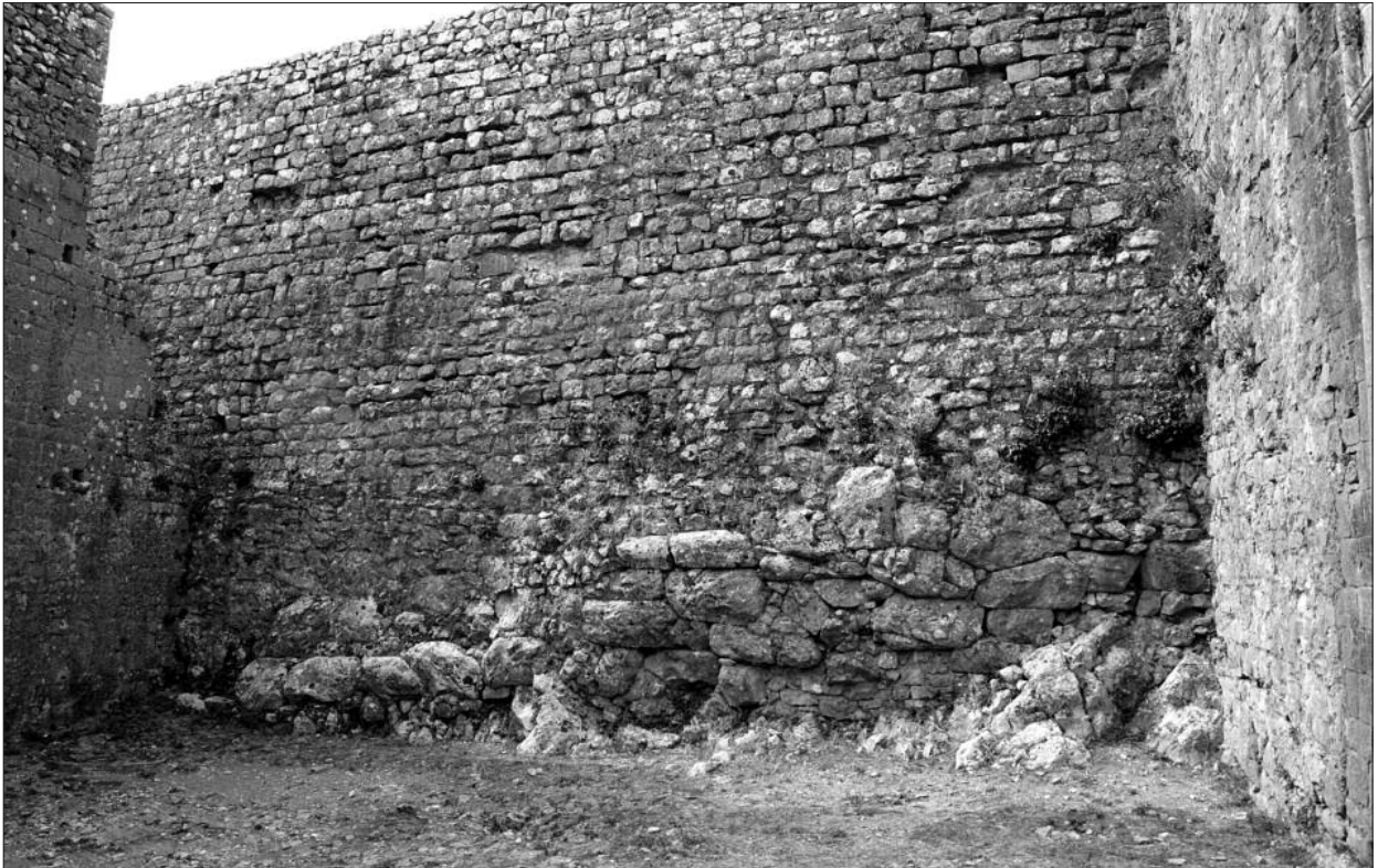
Fig. 2. Illyrian wall as a foundation for Venetian architecture.

Ryc. 2. Mury iliryjskie nadbudowane w czasach weneckich.