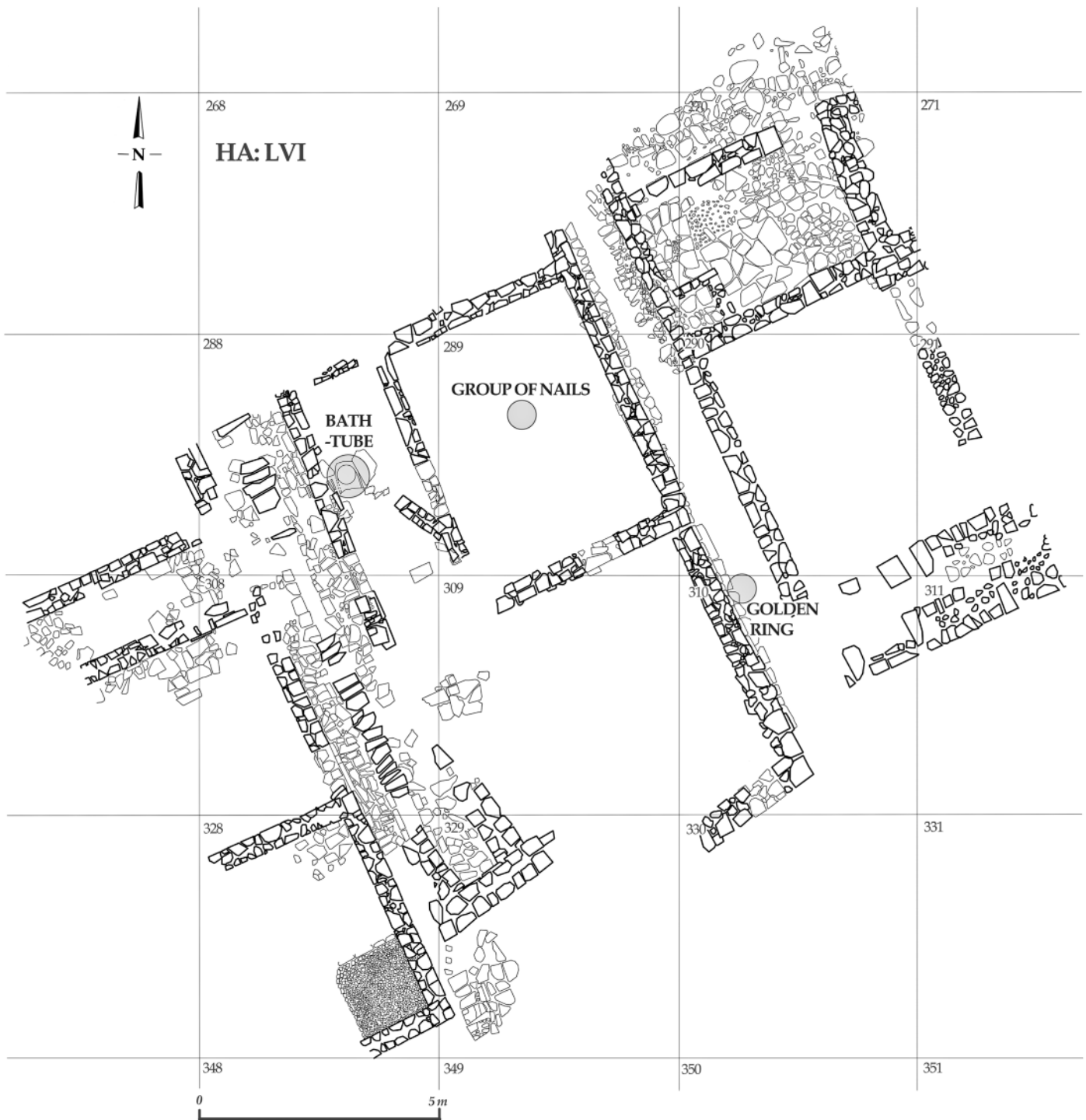
Fig. 1. Plan of the chambers cleared in Sector Carine VII (Drawing T. Kowal, M. Różycka).

Ryc. 1. Rzut poziomy pomieszczeń odsłoniętych na Carine VII.