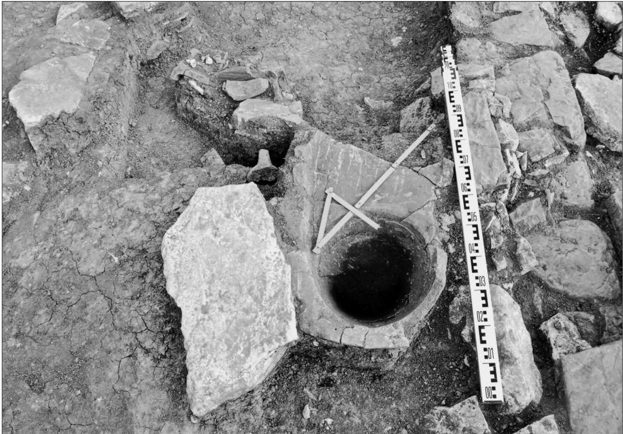
Fig. 3. Terracotta bathtub in situ.