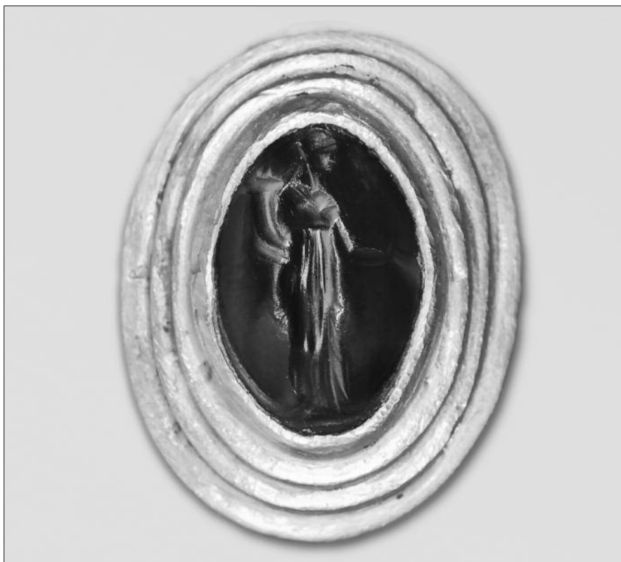
Fig. 4. Golden ring with an image of Artemis.

Ryc. 4. Złoty pierścień z wizerunkiem Artemidy.