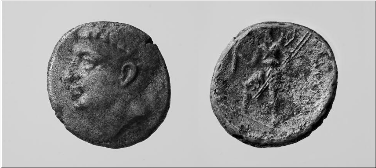
Fig. 6. Silver coin ( subaeratus ) with the image of King Ballaios, obverse and reverse. Ryc. 6. Awers i rewers srebrnej monety ( subaeratus ) z wizerunkiem króla Ballaiosa.

The Risan excavations have produced to date many nails which have been studied, resulting in a typology being prepared (LITWINOWICZ 2010: 165–175). A broken pot of local make, found in one of the rooms in the “House of Aglaos” in 2011, contained a set of bronze nails comprising 25 whole nails and 10 shaft fragments (Fig. 5). Bent heads and crooked shafts are proof that the nails were used. A preliminary analysis (the set will be studied by P. Litwinowicz) indicated the presence of three different types: 1. structural; 2. for fittings such as doors (WALSCH 1983: 45–50), window grilles (ULRICH 2007: 69), cart- and boatbuilding (BOCKIUS 2007: 35); and 3. for furniture (bigger pieces, large chests and caskets). The structural nails seem to be of greatest interest; they appear to have been used for beams and rafters (ULRICH 2007: 61–69). The longest of the nails from this group was 17.5 cm, the bent end measuring 3.5 cm, which indicates that it was passed through a construction 14 cm thick.