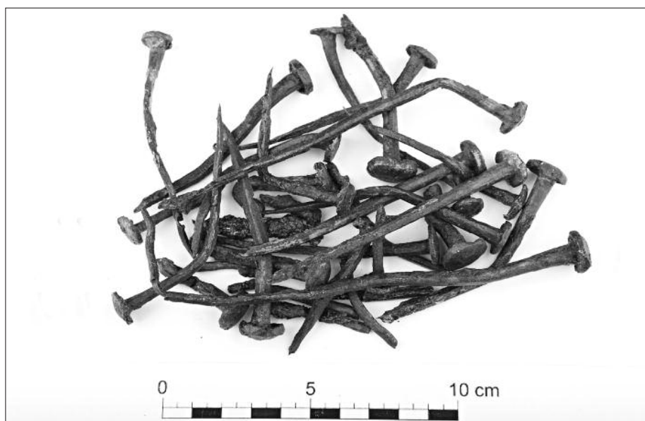
Fig. 5. Group of bronze nails (after conservation) (Photo P. Kajak).

broad trade contacts and cultural ties between Rhizon inhabitants and other towns in the Mediterranean. A similarly made ring was discovered during excavations of the Hellenistic necropolis in Budva (MARKOVIĆ 2006: fig. 69). The ring from Rhizon was found next to three bronze coins of Ballaios (DYCZEK 2011: 42), conveniently precisising the time when it was lost. Artemis was worshipped at Risan and it is also noteworthy that her image appears on the reverse of King Ballaios' coins (CIOLEK 2011: 28–31).