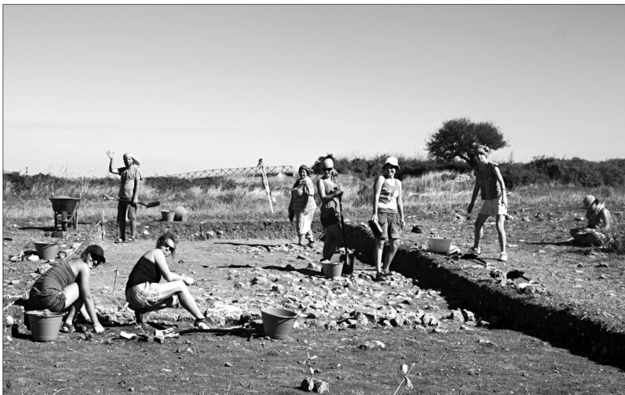
Fig. 1. The work in Trench No. I.