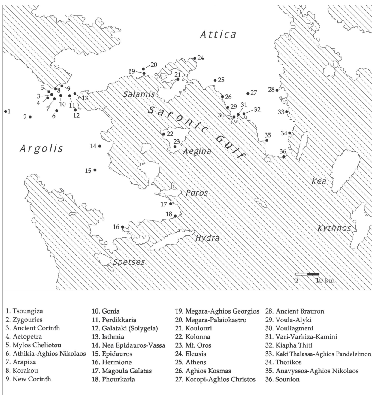
Fig. 1. The Saronic Gulf. The Early Mycenaean period (P. Berezowski)

This region of dynamic trade certainly played a significant role in the history of the period. The principal centre of this exchange, particularly in the Early Mycenaean period, was Aegina. It seems likely that the settlements located on the coasts of the Saronic Gulf participated in the distribution of pottery and other objects imported from distant parts of the Aegean world. They were also involved in the transfer and propagation of ideas reaching Mycenaean Greece through the Saronic Gulf.